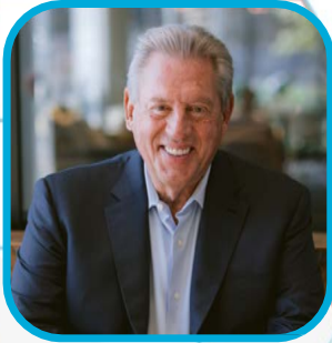
JOHN C. MAXWELL #1 Leadership Expert and Best-Selling Author